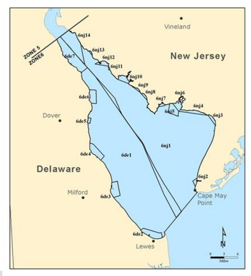
Figure 2. Example Zone 6 Shellfish Management Assessment Units (2010)