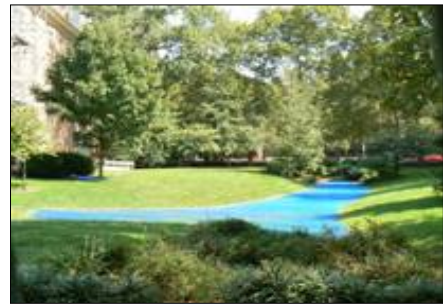
Photo: Art Installation "Drawing Dock Creek" by Winifred Lutz (P. V'Combe)

The story of Dock Street during the 1700's is representative of the tensions that still exist between the balances of "liberty" with the "public good" in Pennsylvania. Benjamin Franklin argued for "public rights" and against industrial pollution when the disposal of rotting animal parts from slaughterhouses and tanneries located on Dock Creek, in Philadelphia in 1739. Citizens' complaints were recorded as early as 1699 about the creek being literally choked with hair, horns, guts and other byproducts of those industries. Foul smells, lower property values, and disease are cited as cause for "state" action. The few fish that entered the creek "soon floated belly up." By 1739 the General Assembly was receiving numerous petitions to move the tanneries and slaughterhouses which they said were creating epidemics of disease in the city. The tanners responded with proposals for self-regulation and complained that "an attempt" (attack) on their liberty was being made. Franklin argued in his Gazette, for what he called "public rights." Rather than an attack on tanneries, Franklin saw "only a modest Attempt to deliver a great Number of Tradesmen from being poisoned by a few, and restore to them the Liberty of Breathing freely in their own Houses."