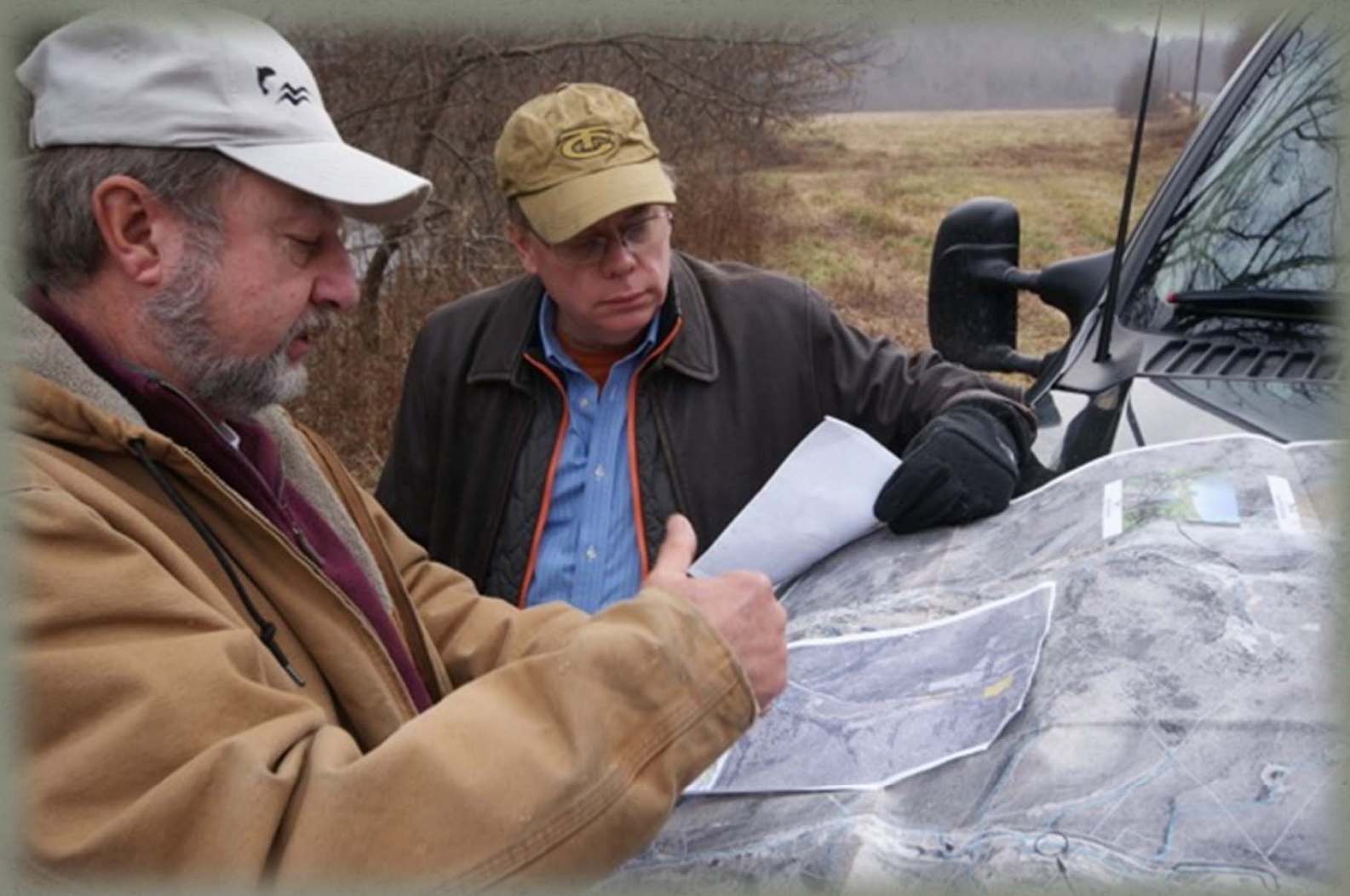
Sands Creek Restoration Project (Site 5)

and spend it on things that need repair.