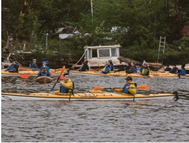
Kayakers in the Delaware River backchannel with the Mayor of Camden at The Mayor's Paddle in May 2019