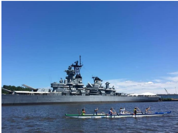
Paddlers next to the USS New Jersey in Camden during the Paddle for Promise event in 2018