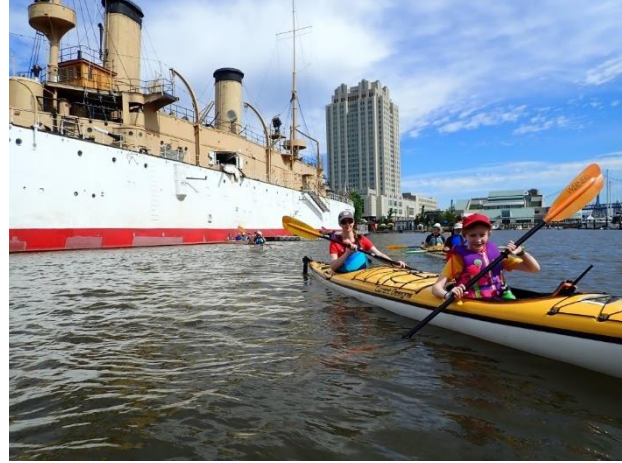
Kayakers behind the USS Olympia at Penn's Landing during a Discover The Delaware event in June 2019