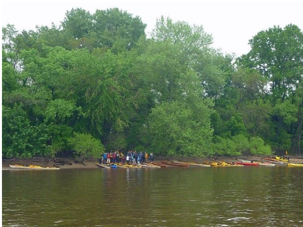
Kayakers on Petty's Island, participating in The Mayor's Paddle in May 2019