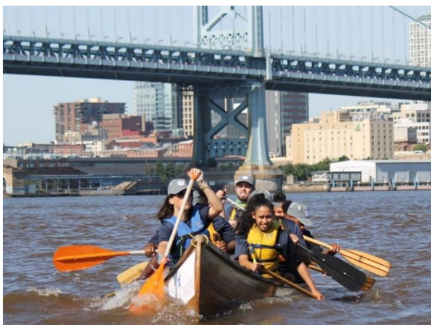
Paddlers near the Ben Franklin Bridge during the Paddle for Promise event in 2018