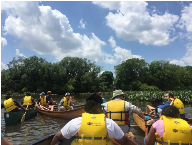
Canoeers along the future site of Cramer Hill Waterfront Park in Camden New Jersey, where the Cooper River meets the Delaware River