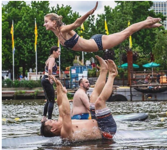
Participants in Aqua Vida's yoga and acro yoga programs at Penn's Landing Marina