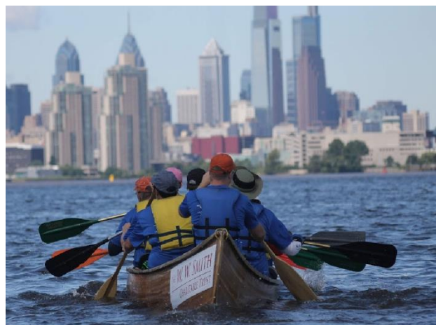
Paddlers canoeing along Philadelphia during the Paddle for Promise event in 2018