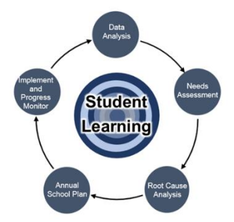
Figure 1: New Jersey Annual School Planning Process

It is essential for local leaders – school principals, district superintendents, community partners and others – to collaborate around how to best support students. Districts and schools need to be proactive and thoughtful about including stakeholders in every step of the local planning process: to analyze data, assess need and identify root causes, write and implement annual plans, and progress monitor.