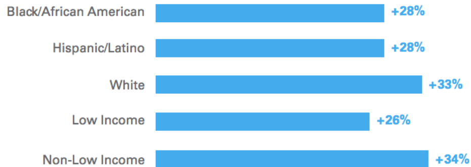
Figure 4: Increase in probability of college graduation within five years or less compared with students not participating in AP, by ethnicity and socioeconomic status

Adapted from Dougherty, Mellor, and Jian, 2006