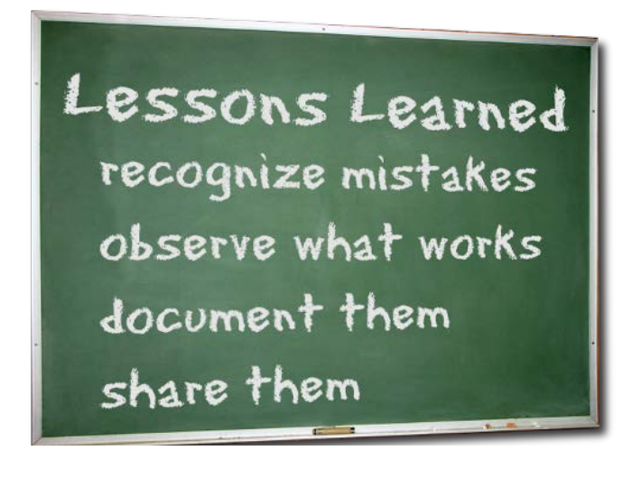
About ... The K-12 School Security Task Force

✓ Next Steps of Safer Schools for a Better Tomorrow Intiative