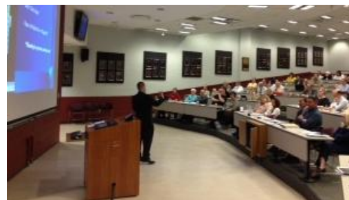
Sergeant First Class Dunham of the Office of Emergency Management presenting at a New Jersey Department of Education Refresher Training for non-public schools on School Safety & Preparedness in Bergen County (4/9/13).