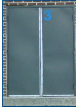
Exterior door with number on door