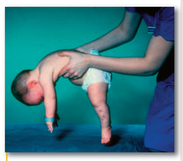
The above photo is a depiction of a "floppy baby," a classic clinical sign of infant botulism.

Infant botulism occurs when babies ingest the spores of botulinum bacteria, which then germinate and produce a toxin in the intestines. An infant can ingest these spores through food (most commonly, honey/corn syrup), soil or contaminated dust. In general, the disease occurs in children less than one year old due to the inability of the immature intestines to move the spores through and out of the body before the toxin forms. Therefore, once an infant ingests the spores, the bacteria germinate, multiply, and produce a toxin which, in turn, can affect the infant's nervous system. The most common symptoms of