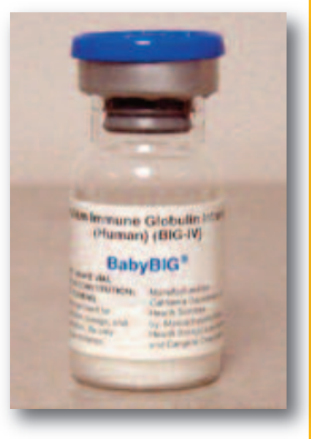
BabyBIG®, Botulism Immune Globulin Intravenous (Human) (BIG-IV), is an orphan drug that consists of human-derived anti-botulism toxin antibodies that is approved by the U.S. Food and Drug Administration for the treatment of infant botulism types A and B.

the first 24-48 hours after administration. Laboratory testing is not performed to either rule in or rule out the disease, due to the length of time it takes to receive preliminary results (24 hrs. at a minimum). Therefore, treatment should not be delayed. Stool specimen testing is purely confirmatory.