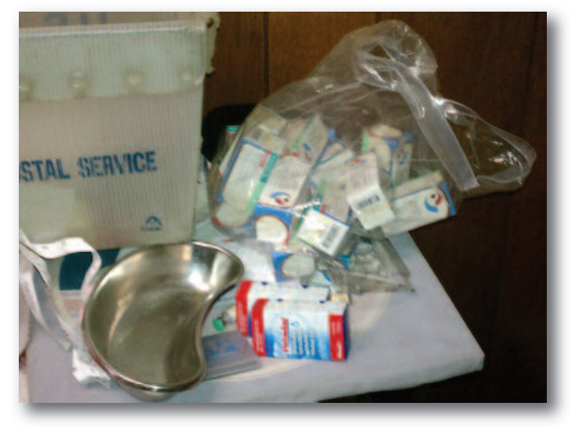
Vaccines exposed to temperatures outside the recommended ranges can have reduced potency and protection.

protocols. Please visit the following resources to help you create a comprehensive plan for your office.