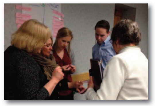
Participants during interactive activity.