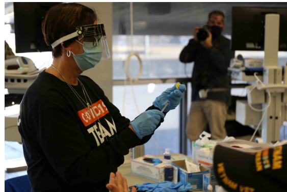
A vaccine dose is readied at the Meadowlands megasite.

The staff is a mix of healthcare professionals from the site's healthcare partner, or, in Gloucester, from the county health department; National Guard; representatives from NJDOH, state Office of Emergency Management and State Police; and some volunteers. In addition, there are administration staff from the healthcare partner, security and also a full medical team onsite in case of an adverse reaction.