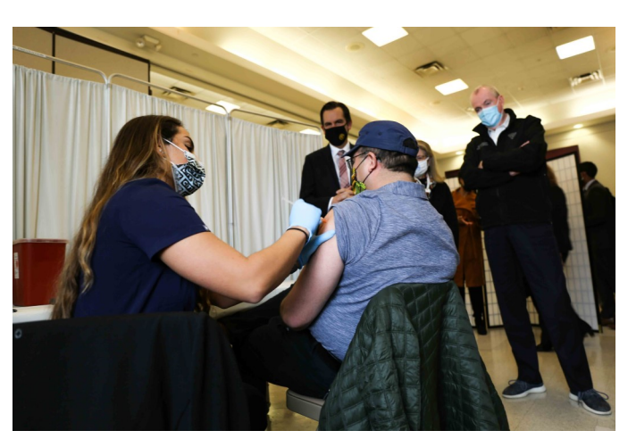
Jersey City Mayor Steven Fulop, NJDOH Commissioner Persichilli and Governor Murphy visit the Mary McLeod Bethune Life Center community vaccination site Wednesday.

CVS received 19,900 doses and Rite Aid 7,500 doses through a direct allocation from the federal government without tapping into the state's supply.