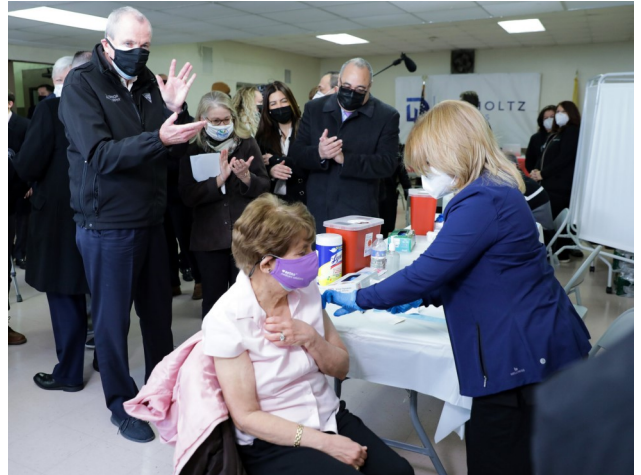
Governor Murphy and Commissioner Persichilli watch as seniors in Union City receive the J&J vaccine.

This week, a site at Calvary Baptist Church opened in Paterson as vaccinations wrapped up in Elizabeth and Trenton. Next week, Paterson vaccinations will move to the Cathedral of Saint John the Baptist, and two new sites will open this weekend at the BB&T Pavilion in Camden and Collier Community Center in Jersey City. Overall, the 10 sites – which include Somerset, Vineland, Orange, Newark and Pleasantville – will vaccinate over 34,000 residents during two weeks in each city. The sites operate as closed points of distribution for members of the immediate community and by appointment only.