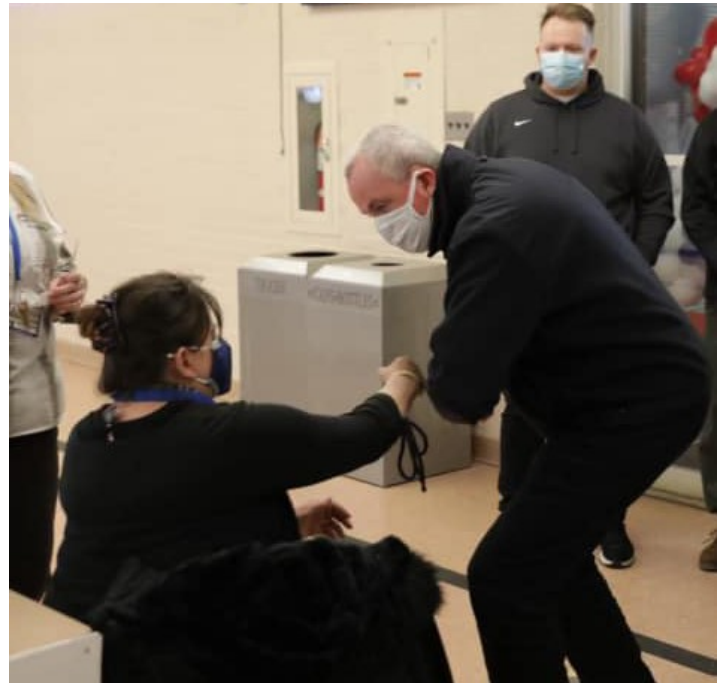
Governor Murphy visited the Gloucester County mega-site last Saturday as vaccinations for educators got underway.

On Monday, eligibility will expand to add public and local transportation workers, including bus, taxi, rideshare and airport employees, NJ Transit workers and Motor Vehicle Commissioner staff; public safety workers not previously eligible; migrant farm workers; members of tribal communities; individuals experiencing homelessness and those living in shelters, including domestic violence shelters; and