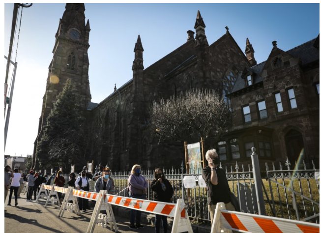
People line up outside the Cathedral of St. John the Baptist community-based vaccination partnership site in Paterson on Tuesday.

The sites are supported through a partnership by the New Jersey Department of Health, New Jersey Office of Emergency Management, Federal Emergency Management Agency, and U.S. Department of Defense, in addition to local faith leaders, nonprofit organizations, local officials, and health departments.