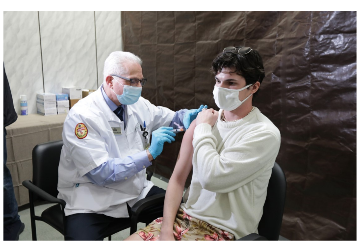
Vaccinations continue in sites statewide such as a ShopRite Pharmacy in Toms River recently.

closely with the state Office of the Secretary of Higher Education, has reached out to the state's college and universities, enlisting their assistance in helping to inform and activate their students.