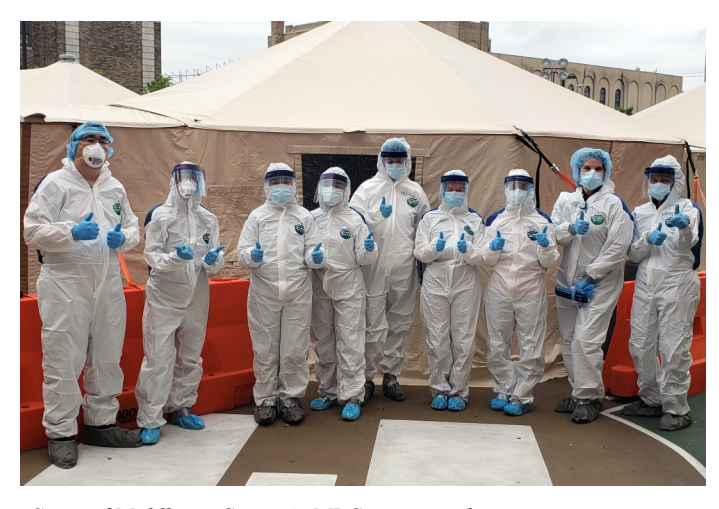
Some of Middlesex County's MRC team members.

The U.S. Department of Health and Human Services also