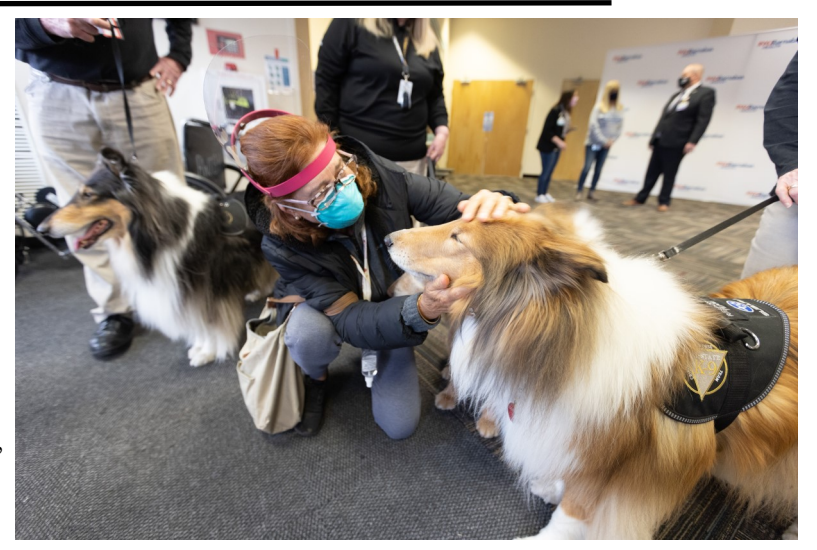
Therapy dogs from the Tri-State Canine Response Team interact with members of the community as part of RWJBarnabas Health's Hope and Healing program at the Middlesex County mega-site.

The six mega-sites include: Meadowlands Racetrack, Bergen County; Rockway Townsquare, Morris County; New Jersey Convention and Expo Center, Middlesex County; Rowan College of South Jersey, Gloucester County; Moorestown Mall, Burlington County; Atlantic City Convention Center, Atlantic County.