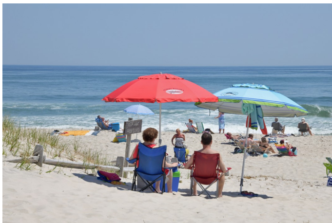
The State Parks Vax Pass will allow free access to all state parks, including Island Beach State Park.