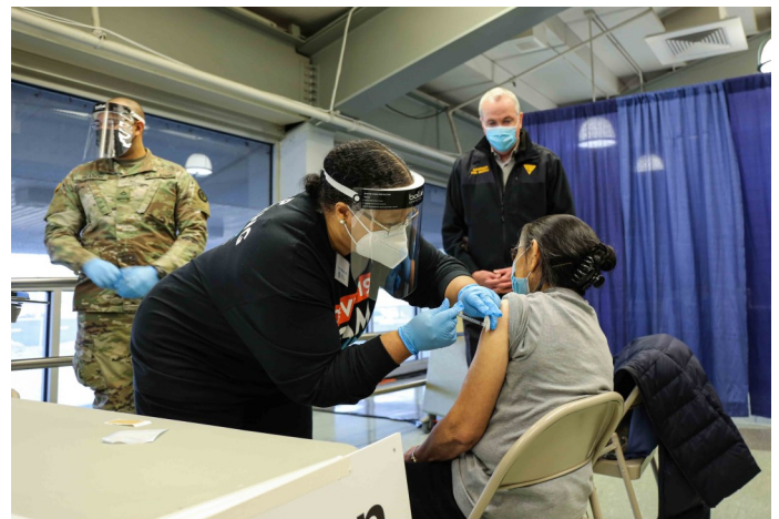
Governor Murphy visits the Meadowlands megasite in January.

"We still have work to do, but as I've said, we are now at the point where our attention will be focused on the local