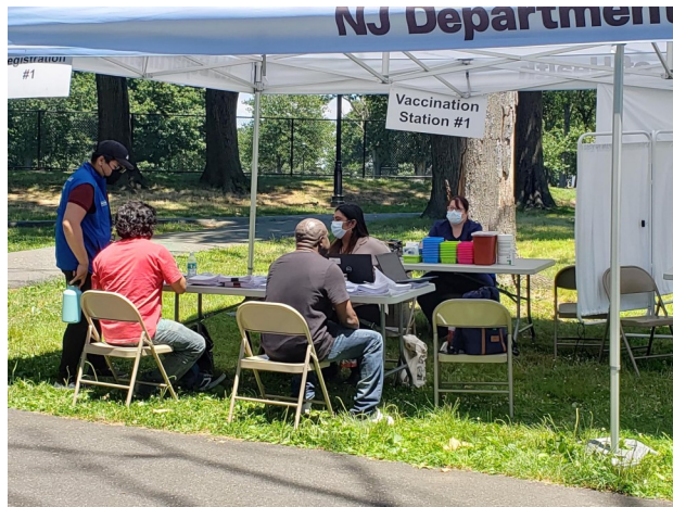
A pop-up vaccination clinic with the Mobile Command Center bus took place Thursday in Irvington Park.