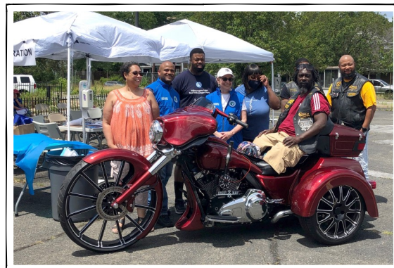
Shiloh Baptist Church, Trenton above; Our Lady of the Angels, Trenton, below.

You can find more event listings at: covid19.nj.gov/communitycalendar .