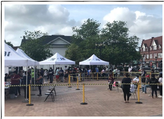
All Saints Episcopal Church, Lakewood, above; Shiloh Baptist Church, Trenton, below.

Grateful for the Shot events continued to take place over the weekend of June 26-27 sponsored by houses of worship in key communities. Over 700 people in total were vaccinated at all of the weekend events.