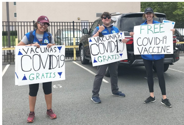
Peace Corps members assigned to the Federal Emergency Management Agency in coordination with NJDOH's COVID Community Corps getting ready to canvass in Trenton for a department vaccination event.