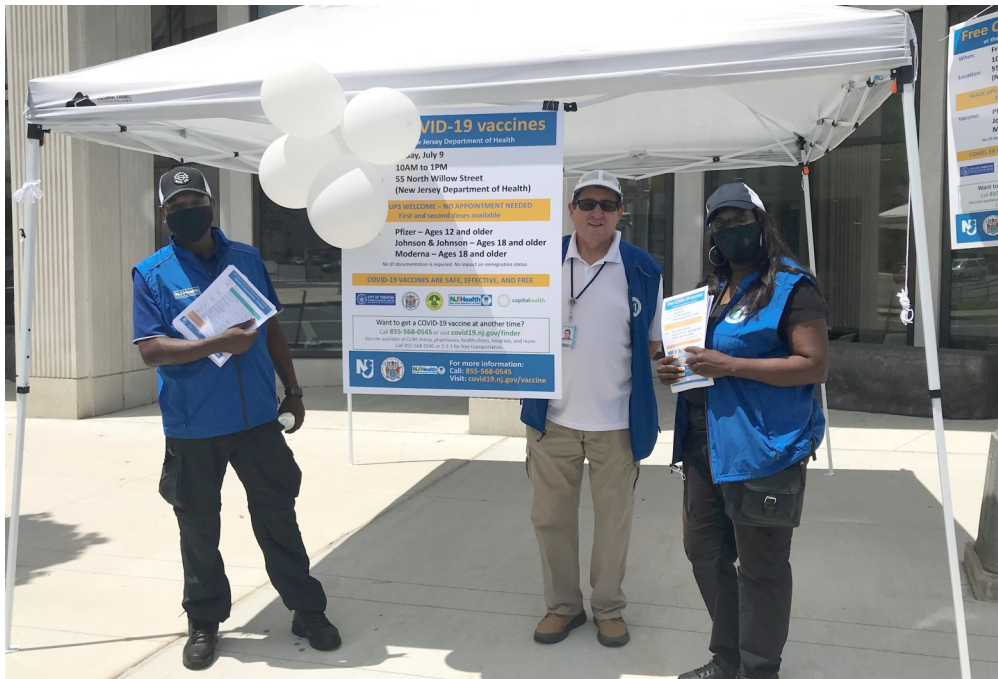
NJDOH and community outreach staff work to draw area residents to the Friday event.