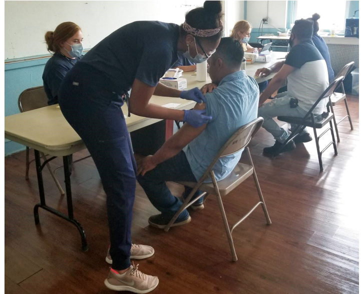
Vaccinations at a Grateful for the Shot event sponsored last weekend by the Parish of Our Lady of the Angels in Trenton.