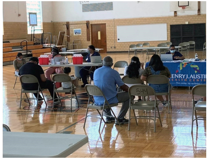
Residents, top, waiting to register for vaccination in the gym at the Hedgepath-Williams Middle School in Trenton. Below left, people at a Lakewood vaccination site sponsored by Ocean Health Initiatives and All Saints Episcopal Church, and bottom right, residents line a hallway at Trenton High School during a COVID-19 testing and vaccination event.

In addition to schools, the county ambassadors have been reaching out to build and expand on partnerships including local and county health departments, hospitals, community groups, interfaith leaders, food banks, businesses, community health centers and other groups.