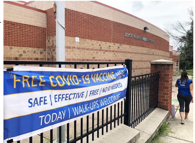
NJDOH recently worked with Trenton schools and local and city health officials on a series of vaccination events for students, faculty, staff, parents and other community members.