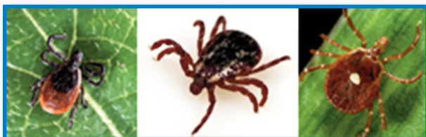
Black-legged "deer" tick