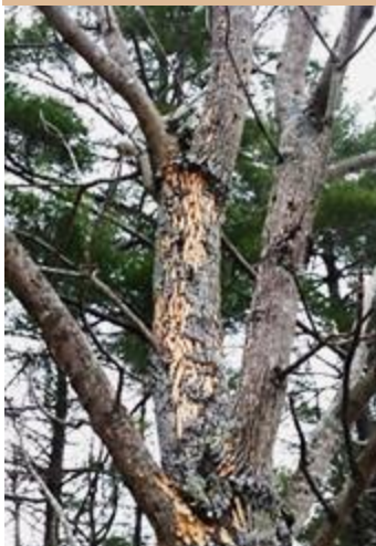
Learn about EAB at http://bit.ly/2GX98nG