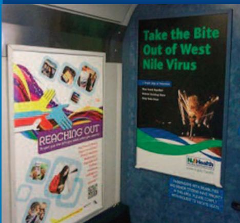
A West Nile Virus poster on an NJ Transit train. The poster is part of the Department's second annual WNV public information campaign.

Read more at: http://www.nj.gov/health/news/2014/approved/20140724a.html