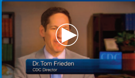
CDC Video: Opioid Painkiller Prescribing: Where You Live Makes a Difference.

Read more at: http://www.cdc.gov/media/releases/2014/p0701-opioid-painkiller.html