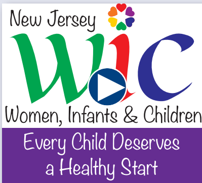
Video: WIC 40th Anniversary Video.