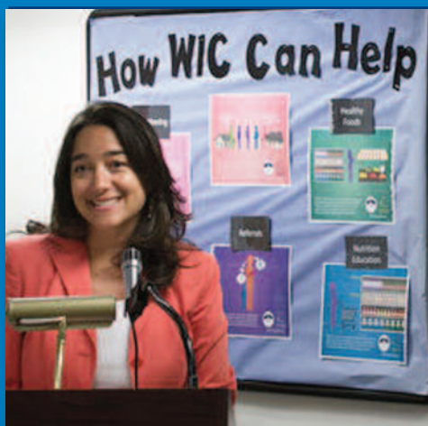
Commissioner O'Dowd helps celebrate WIC's 40th Anniversary by visiting the Mercer County WIC Program in Trenton on July 28.