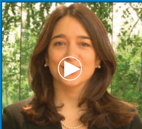
Video: West Nile Virus Public Service Announcement.