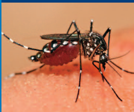
The Aedes aegypti mosquito can carry the West Nile Virus.