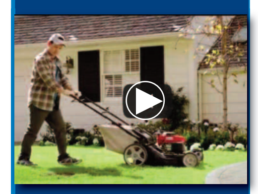
Skin Cancer Public Service Announcement by the American Academy of Dermotology

CDC Video: How to Stay Cool in Extreme Heat