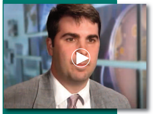
Mayo Clinic Video: The 4 Stages of Melanoma: The Deadliest Form of Skin Cancer

Any concerning skin lesion or change in moles should be promptly evaluated by a physician, preferably a dermatologist, to assess the need for a biopsy. Remember the ABCDE s concerning the visual appearance for moles and lesions: A for asymmetry, B for border irregularity, C for color variation, D for a large diameter, E for evolution of the lesion or mole. Remember, early detection leads to high cure rates of all skin cancers. So even if prevention fails, don't miss your chance to be cured with an early intervention.