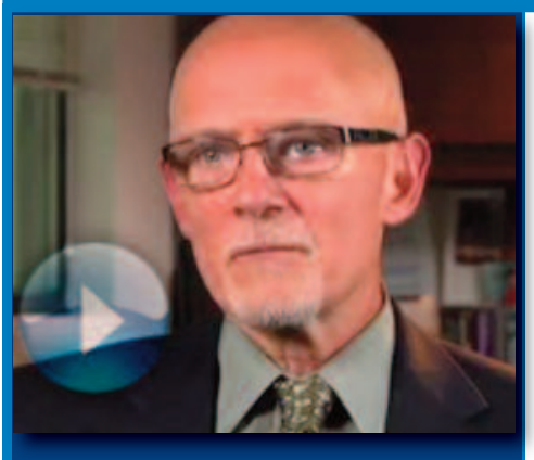
Video: Learn why Public Health Accreditation is important to improving health services.