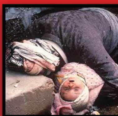
GB, GF, VX, HD Halabja, Kurdistan (1988)