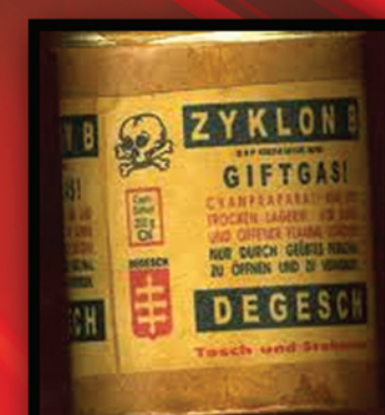
CU, Auschwitz, WWII