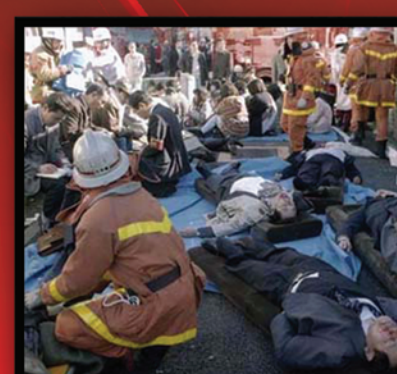
GB, Tokyo Subway (1995)