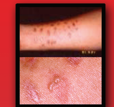
L, Desert Storm (1991)