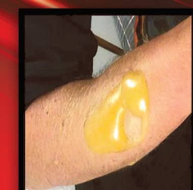
HD, Munition Shell (2010)