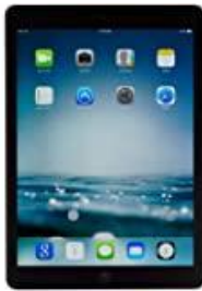
Tablet - Apple iPad Wi-Fi Only 64GB* Requires Access to Internet Service.

For those of you who need low-cost internet service there may be an option through the FCC Emergency Broadband Benefit - https://www.fcc.gov/broadbandbenefit