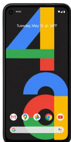
Smartphone - Google Pixel 5a Wi-Fi & 4G 128GB B*Requires Cellular Service Plan.