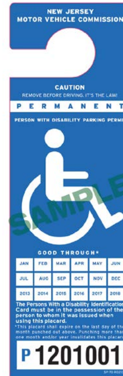
FIGURE 2: Permanent Person with a Disability Placard