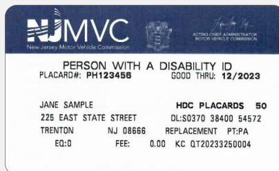
FIGURE 1: Person with a Disability Identification Card