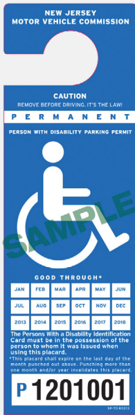
FIGURE 2: Permanent Person with a Disability Placard