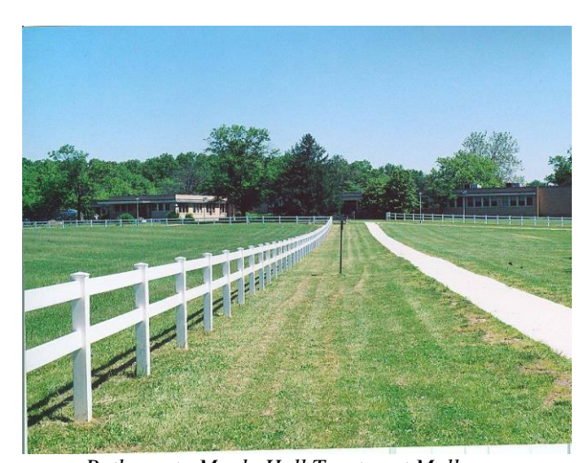
Pathway to Maple Hall Treatment Mall

The hospital currently consists of four patient-occupied buildings (Main Building, Larch Hall, Cedar Hall, and Holly Hall). There is a cafeteria, gymnasium, chapel, commissary, swimming pool, greenhouse, and community-organized Fresh Start Wellness Center on grounds. Patients have daily individualized schedules which include programs offered by almost all clinical disciplines to learn and build upon skills necessary for successful community living. Treatment teams work with patients to select groups and activities based on patient-identified goals. Most scheduled programs, including psychology groups, take place at the treatment malls.