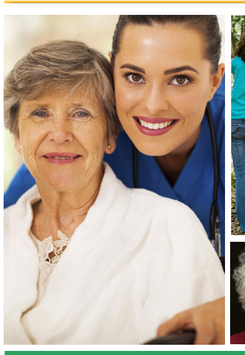
A Program of the NJ Department of Human Services, Division of Aging Services