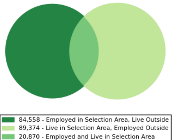
Inflow/Outflow Job Counts in 2013