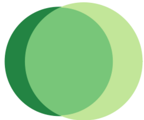
Inflow/Outflow Job Counts in 2013

■ 144,335 - Employed in Selection Area, Live Outside ■ 258,844 - Live in Selection Area, Employed Outside ■ 534,346 - Employed and Live in Selection Area