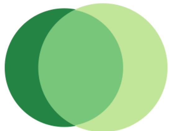
Inflow/Outflow Job Counts in 2015