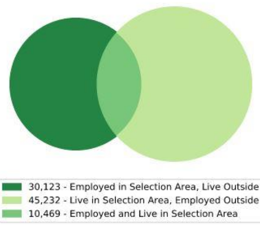
Inflow/Outflow Job Counts in 2017