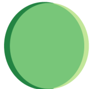
Inflow/Outflow Job Counts in 2018