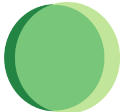
Inflow/Outflow Job Counts in 2018