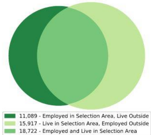
Inflow/Outflow Job Counts in 2019