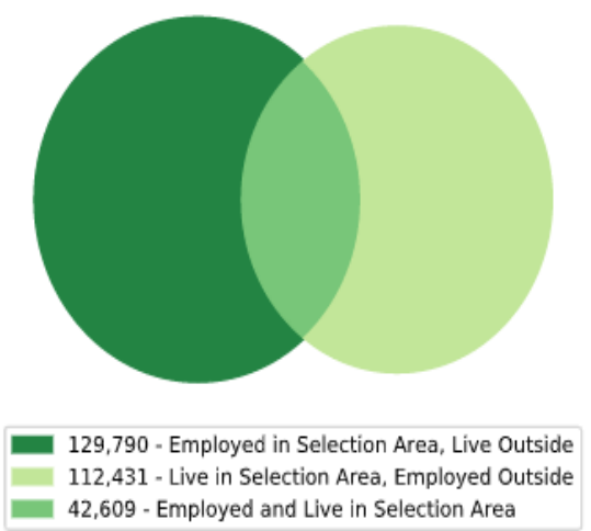
Inflow/Outflow Job Counts in 2020

129,790 - Employed in Selection Area, Live Outside 112,431 - Live in Selection Area, Employed Outside 42,609 - Employed and Live in Selection Area