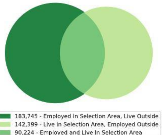
Inflow/Outflow Job Counts in 2021 All Workers