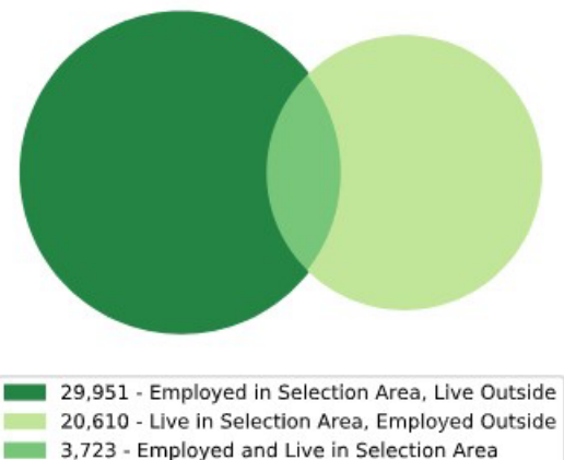
Inflow/Outflow Job Counts in 2022 All Workers