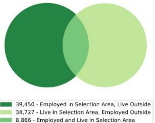
Inflow/Outflow Job Counts in 2022 All Workers