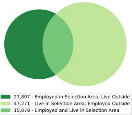
Inflow/Outflow Job Counts in 2022 All Workers