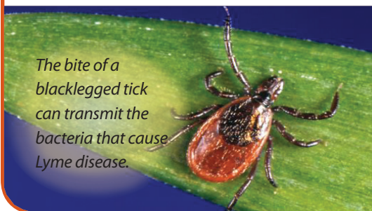
The bite of a blacklegged tick can transmit the bacteria that cause Lyme disease.