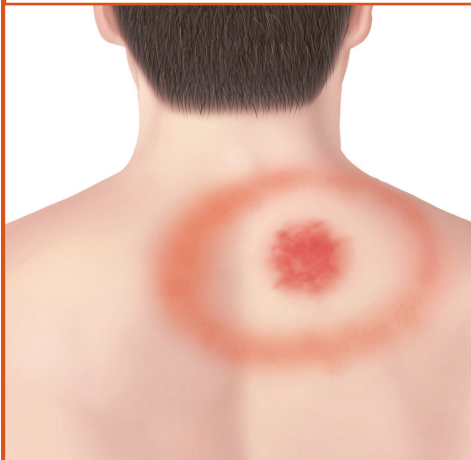
Bull's eye rash on the back.