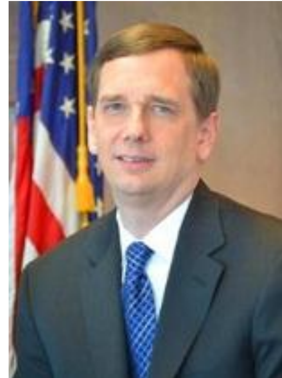
Aaron R. Fichtner Deputy Commissioner New Jersey Department of Labor and Workforce Development (LWD)