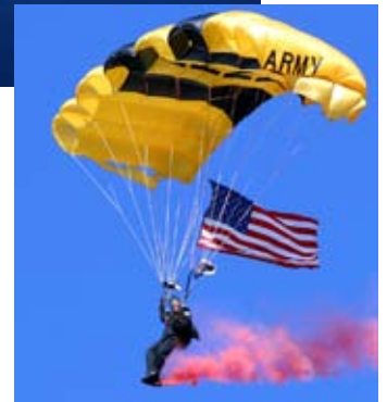
Right - A member of the U.S. Army Golden Knights performs during a show. Courtesy photos.