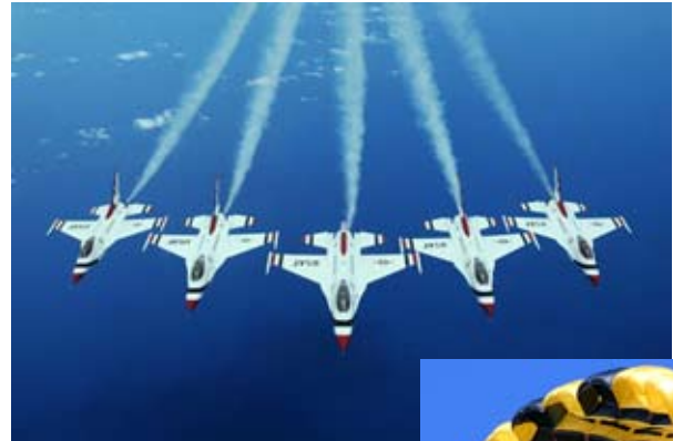
Top - U.S. Air Force Thunderbirds in flight.

The 2010 Atlantic City Airshow comes 100 years after Atlantic City and Asbury Park hosted the first airshow in New Jersey. Exhibits of the "Flying Fearless," will be shown at the Atlantic City International Airport (Terminal Building), Atlantic City Historical Museum and the Township of Ocean Historical Museum. Check the Web site for times and dates to view the exhibits.