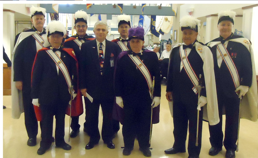
Photo right: The Knights of Columbus visited residents of the Menlo Park home Nov. 20, during the Vietnam Veterans of America #223 "Celebration of Our Veterans" program.