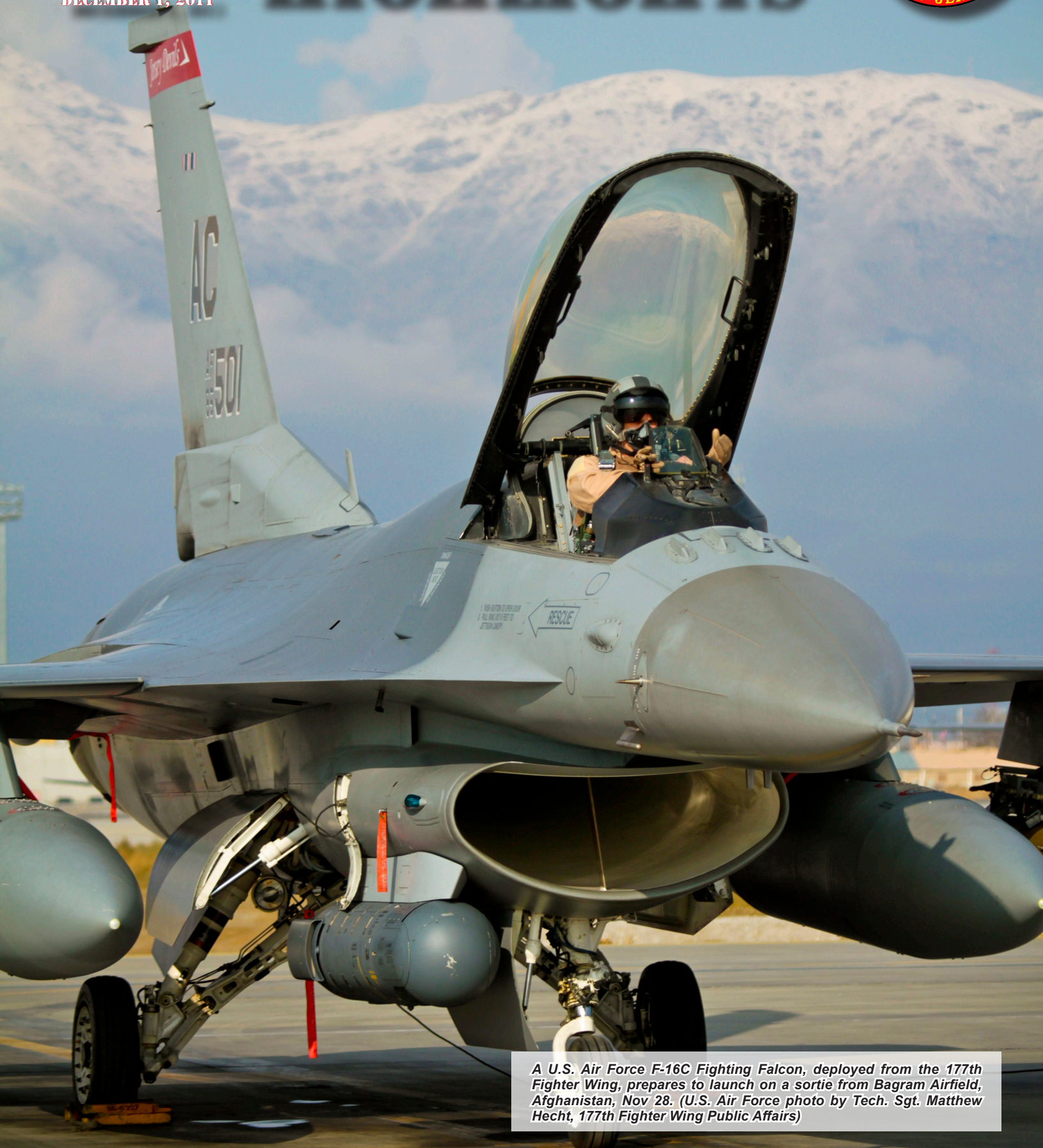
A U.S. Air Force F-16C Fighting Falcon, deployed from the 177th Fighter Wing, prepares to launch on a sortie from Bagram Airfield, Afghanistan, Nov 28.